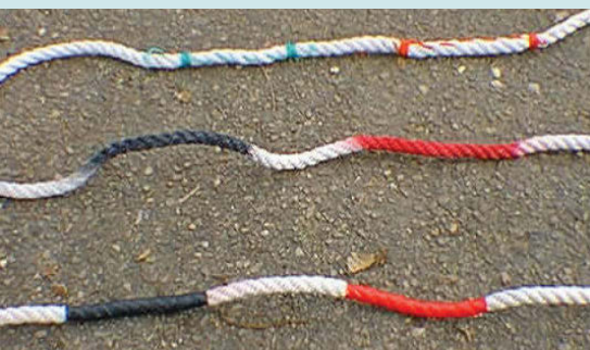
Example of gear markings.

Note: This guide includes only Federal requirements for state and Federal waters; contact your state fishery office for any additional requirements within state waters. Should any regulations overlap with the Plan regulations, the more restrictive regulations apply.