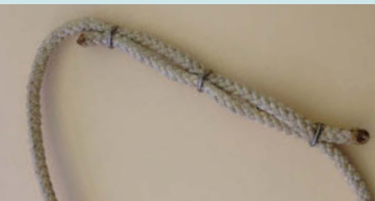
3 hog rings, in a side-by-side configuration, qualifies as a 200 lb. weak link.