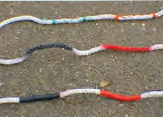
Examples of gear marking methods.

Hog rings can be used to form an eye in the end of a line that will function as a weak link. Up to 7 may be used to create a 600 pound weak link. Hog rings can be distributed (from 6" to 12") without significantly affecting the strength.