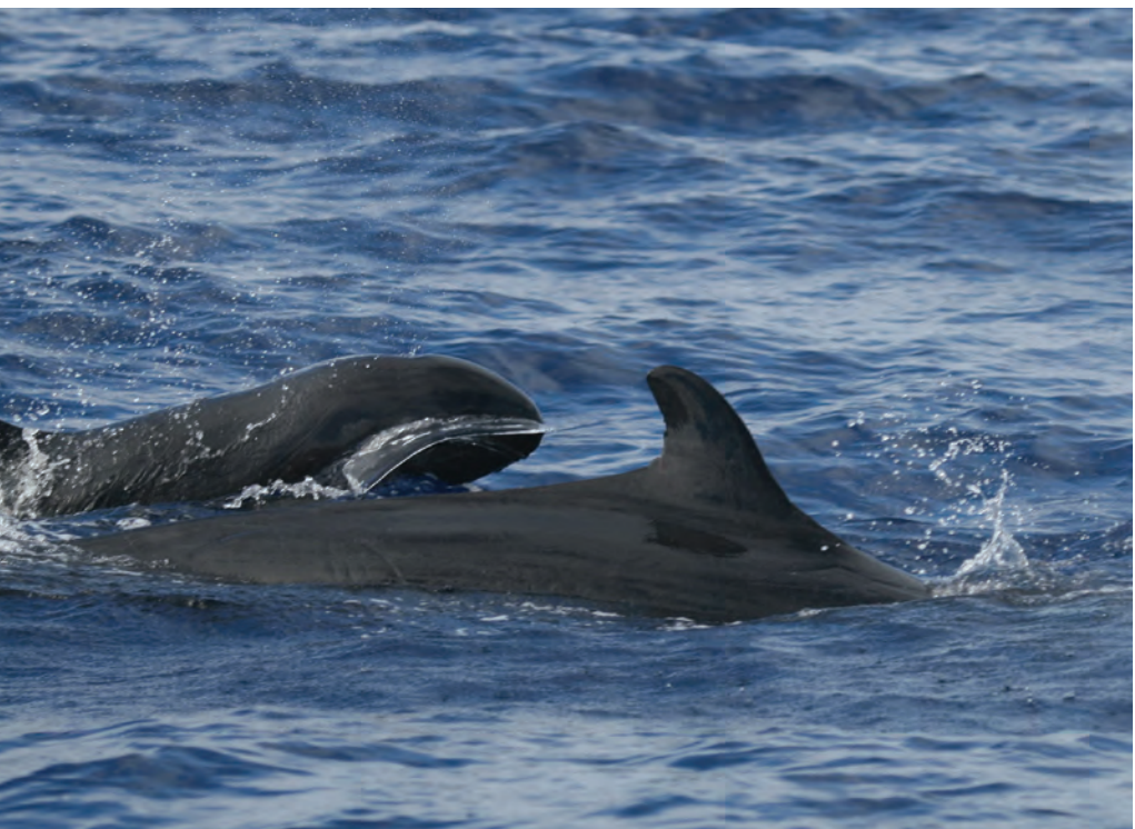
All photos were taken under NOAA Fisheries permit SWFSC 14097