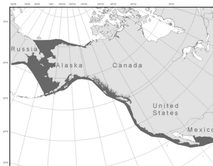
Figure 1. Approximate distribution of the Eastern North Pacific stock of gray whales (shaded area).

Photo-identification studies between northern California and northern British Columbia provide data on the abundance and population structure of PCFG whales (Calambokidis et al. 2012). Gray whales using the study area in summer and autumn include two components: 1) whales that frequently return to the area, display a high degree of intra-seasonal “fidelity” and account for a majority of the sightings between 1 June and 30 November. Despite movement and interchange among sub-regions of the study area, some whales are more likely to return to the same sub-region where they were observed in previous years; 2) “visitors” from the northbound migration that are sighted only in one year, tend to be seen for shorter time periods in that year, and are encountered in more limited areas. Photo-identification (Gosho et al. 2011; Calambokidis et al. 2012) and satellite tagging (Mate et al. 2010; Ford et al.